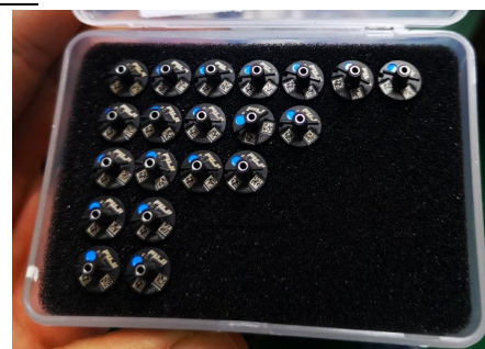
Counterfeit Fuji nozzles

Fuji will continue to focus on the protection of intellectual property rights and take a firm stance against illegal activities such as the manufacture and sale of counterfeit products so that all of our customers can use our products with confidence.