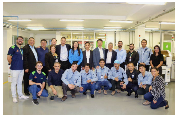
Staff from FMM, FUJI, and FDB

Forging ahead with goal 9 of the Sustainable Development Goals, “Build resilient infrastructure, promote sustainable industrialization and foster innovation” on a global scale, Fuji Group is providing its SMT equipment on loan free of charge through its group companies outside of Japan. This equipment will be used to support the training of talented individuals who will come to play an active role in the electronics industry by providing opportunities to learn about the manufacturing process for electronic devices.