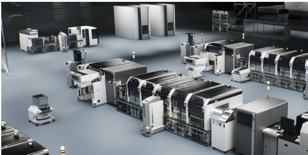
Image of the SMT floor automation system

Going beyond the automation of kitting operations alone, the Auto Kitting Station integrates with the NXTR A model, Smart Storage, AMRs, and automated warehouses. This creates a seamless flow from component storage and supply to placement, enabling automation across the entire SMT floor. This not only improves production efficiency but also accelerates unmanned operation throughout SMT processes, thereby helping to establish a stable production environment even in the face of labor shortages.